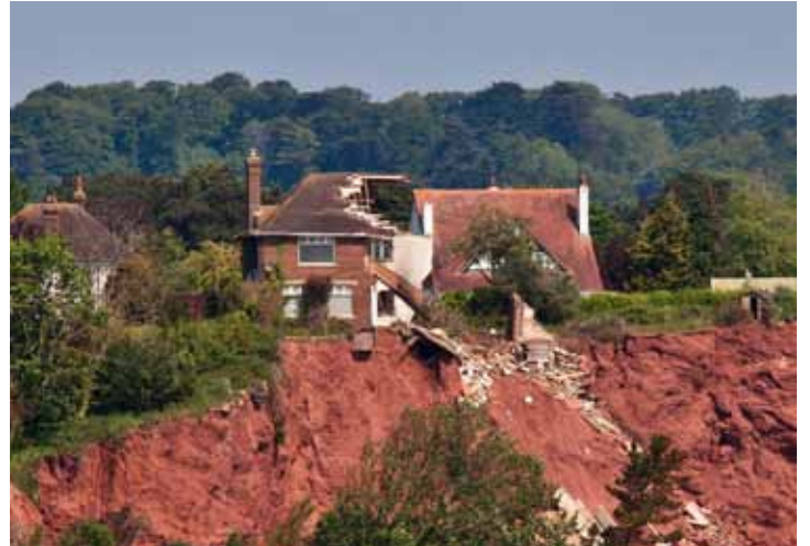
The house perched on the clifftop in 2010 - by 2013 it had almost collapsed

The answer is right before your eyes. You can't fail to notice the exposed red rock above the beach. This is a landslip.